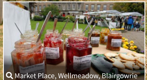
Q Market Place, Wellmeadow, Blairgowrie