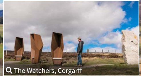
Q The Watchers, Corgarff