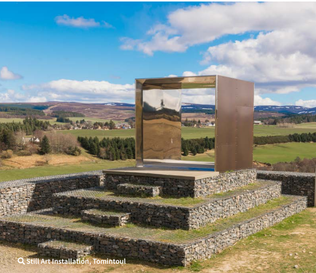
Q Still Art Installation, Tomintoul