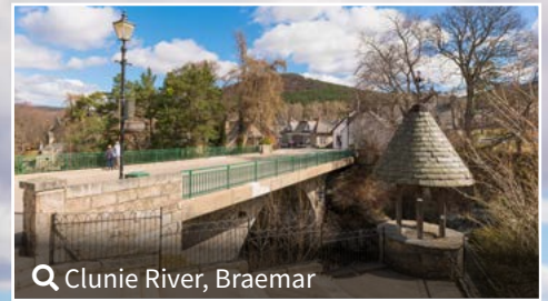
Q Clunie River, Braemar